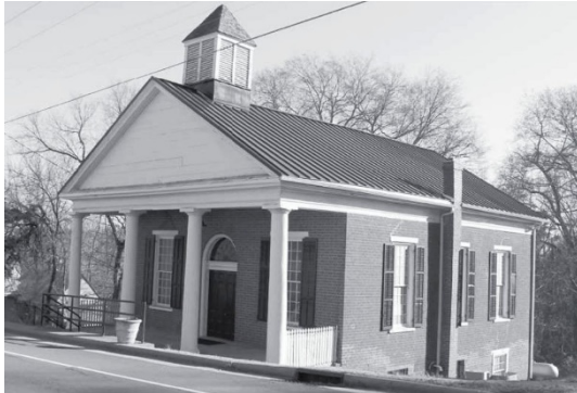
Milton Presbyterian Church