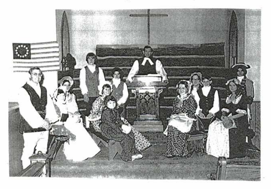
225th Anniversary Pageant in 1975 (above) Presented by the Young People of Lea's Chapel