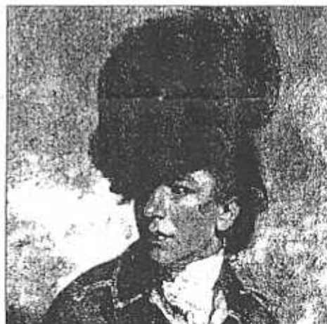
National Gallery, London

General Cornwallis rattled the government out of Richmond to Charlottesville.