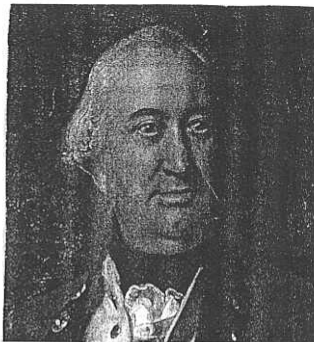
Guildhall Art Library