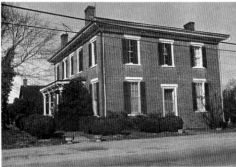
Photo 348. (Former) Milton State Bank. 1859-1863. Built as a branch bank by the Bank of the State of North Carolina on the eve of its Civil War bankruptcy. The 2-story building is a fine example of the transitional Greek Revival-Italianate style. The original banking room and vault are well-preserved. At the rear is a 1½ story brick kitchen, one of the few antebellum kitchens in the county.

The following photograph is believed to be the building that housed the Milton Branch of the Bank of the State of North Carolina and its successor, the Bank of North Carolina: